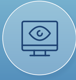
SECURITY AWARENESS TRAINING